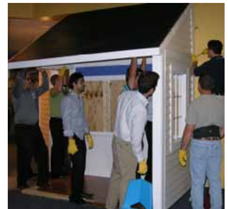
GE volunteers work to construct the new Solar House exhibit that is part of the "GO Power! – Naturally" that features reusable fuel sources!