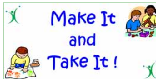
Check out the new Make It and Take! Section and become an inventor