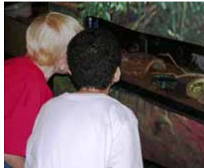
CMOST's extensive animal collection has a new home in the Operation W.I.L.D – "Working In the Living Domain" exhibit

For more information about dates and topics visit www.CMOST.org or call The Museum at 518-235-2120.