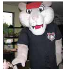
The Physics of Baseball

If you like what you see at CMOST, please support us by contributing to our Annual Appeal – in mailboxes this Fall!